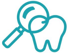
Access and Utilization Rates