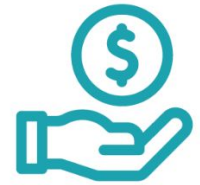
Cost Benefit Analyses