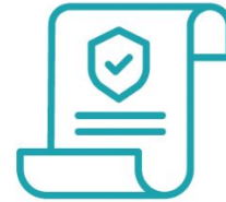
Health Impact Policy Analyses